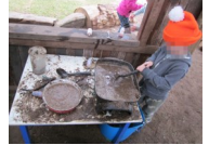
Click picture on how to make a mud pie.

It's starting to warm up outside and after being stuck inside for so long it is time for you to venture out and get some sun. Outside play can be a great way to model the joy of physical activity. Showing your child how to walk on uneven surfaces, balancing, climbing, throwing and kicking a ball, and just exploring the outdoors is a great way to build new learning skills.